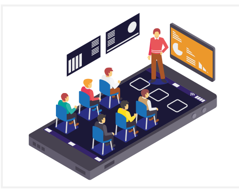
INR 20,000 (ONLINE PRE-RECORDED TRAINING)