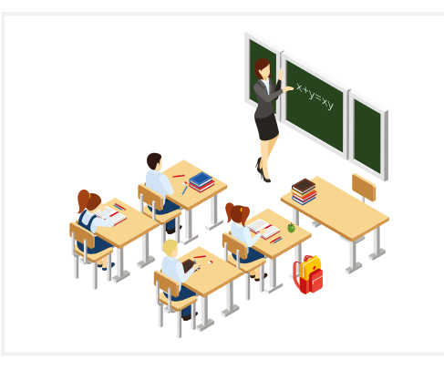
INR 70,000 (CLASSROOM TRAINING)