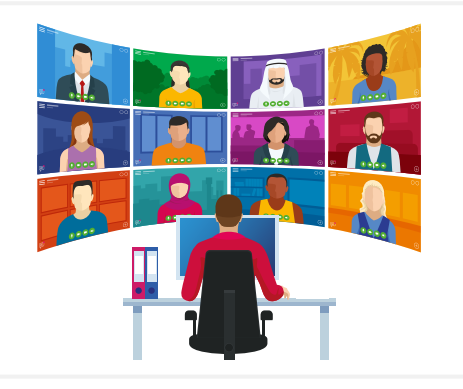
INR 60,000 (REAL TIME ONLINE LIVE TRAINING)